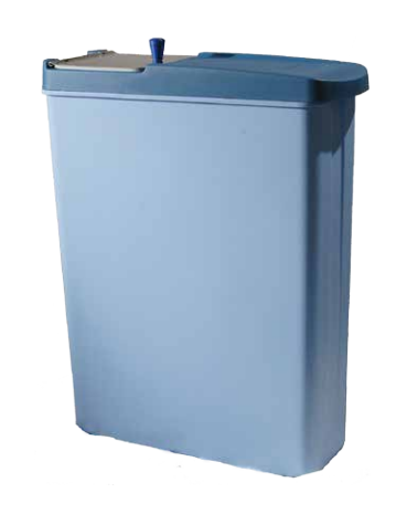
CLASSIC SANITARY UNIT