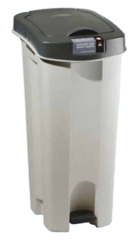
CONCEPT NAPPY UNIT